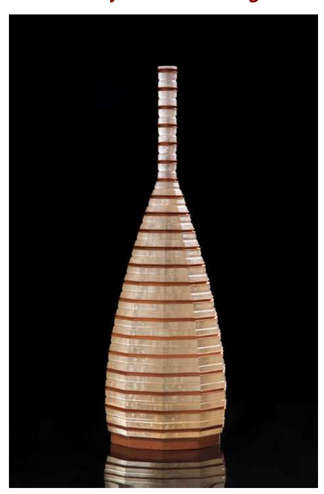
Daniel Clayman, Aurum Marque, 2013, Glass and copper, 6 X 6 X 20"