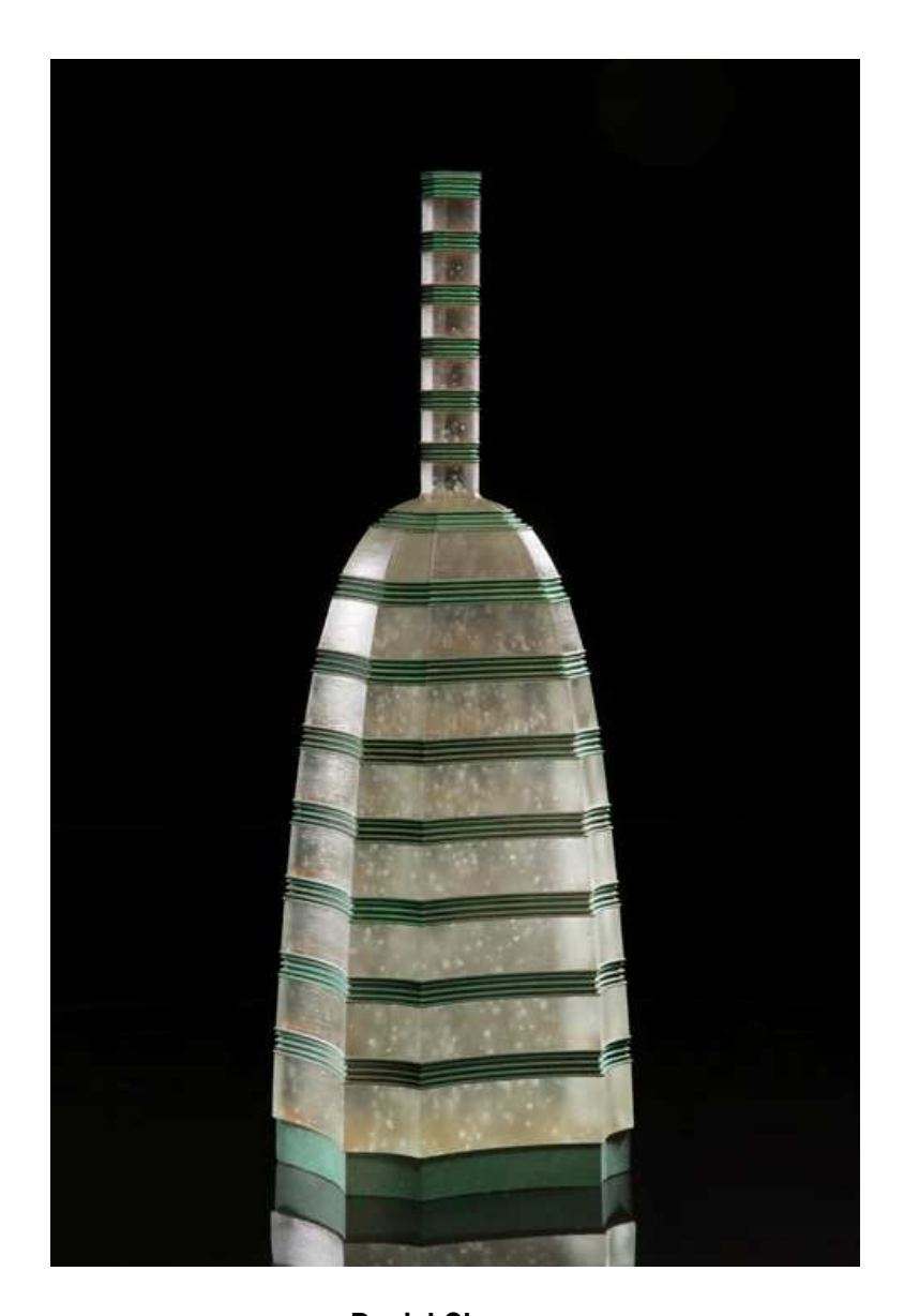
Daniel Clayman Bindan, 2013 Glass and copper 7 X 7 X 23 3/4 inches