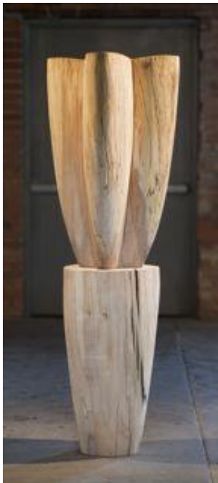
Howard Werner 200 Maple Vessel W: 20" X D: 20" X H: 60"