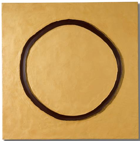
Michelle Stuhl "Yawar Siwi" / Crimson Ring Encaustic on panel 2.5 ft x 2.5 ft