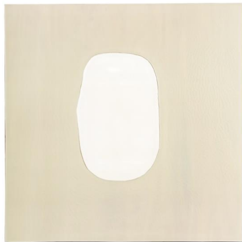
Michelle Stuhl "Hatun Wank'a" / Silver Monolith Encaustic on panel 4 ft x 4 ft