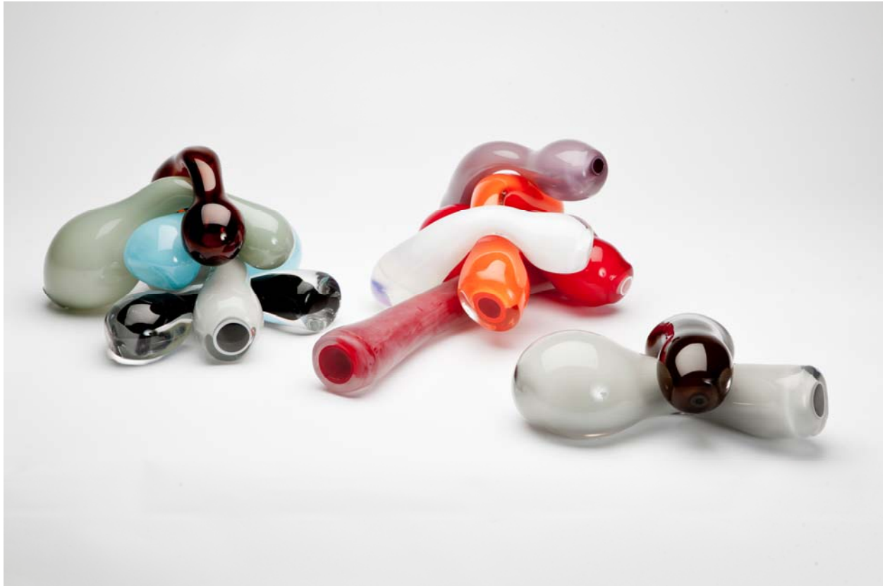
Esque Studio Color Explorations by Andi Kovel, 2012 Blown glass Dimensions vary