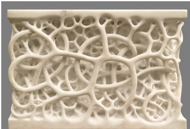
Michael Kukla Twisted , 2010 Marble 9.5 x 15 x 4.5 inches