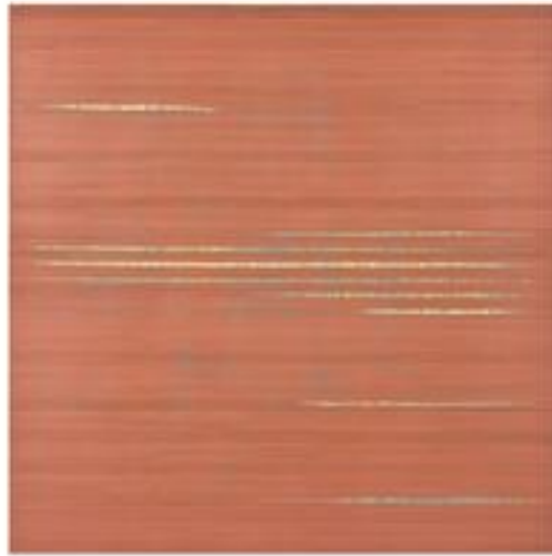
Susan Schwalb Echoes Redoubled, 2007 Silverpoint & acrylic on museum mount board, on wood 30 X 63 inches