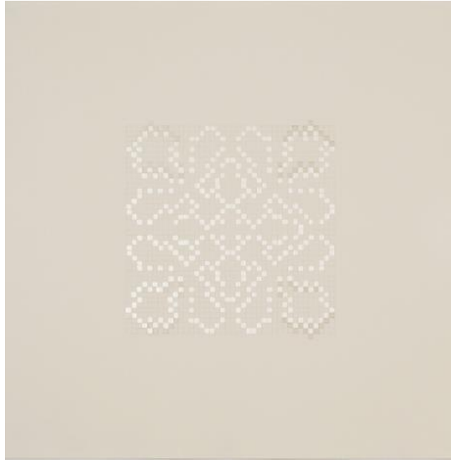
Marietta Hoferer Weeds , 2010 Tape and graphite on paper 22 x 22 inches