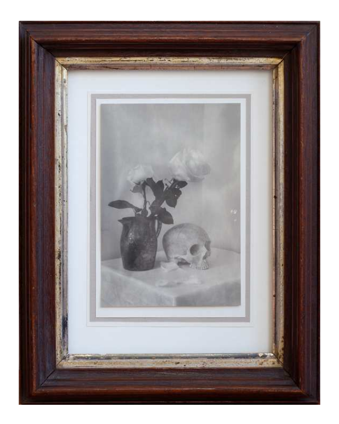
Jefferson Hayman I Can Have Both, 2006 Silver gelatin print, antique frame Edition 3 of 25 7 x 9 inches