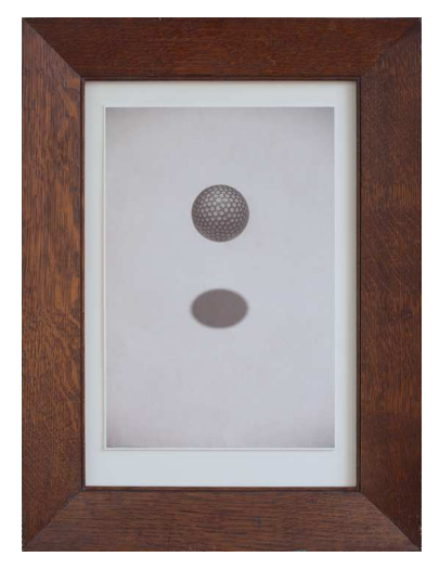
Near Skyline, 2010, Gelatin silver print, antique frame, 9 ½ x 11 ¾ inches Golf Ball, 2013, Pigment Print, antique frame 13 ½ x 18 ½ inches

WEXLER GALLERY December 6, 2013 – March 1, 2014