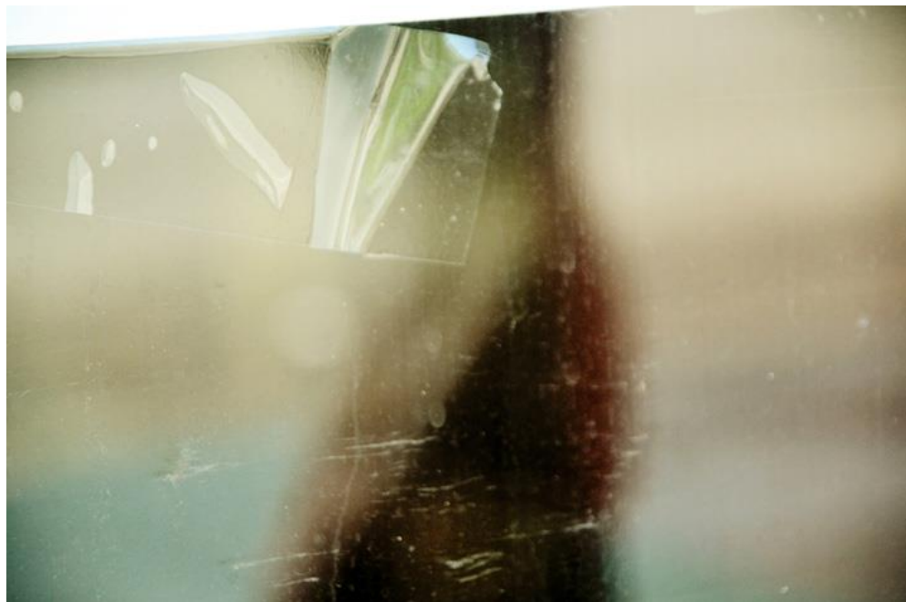
Marilyn Kirsch The Mask, 1/10, 2011 Inkjet print gallery mounted in Plexiglass 20 X 30 inches