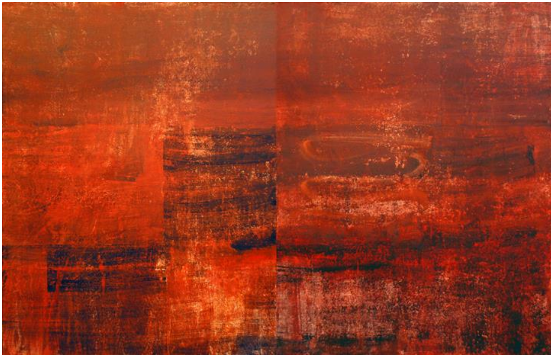
Marilyn Kirsch, The Book of Earth and Fire ("The Four Elements" Series), 2010, Oil on canvas, 72 x 112" Diptych

WEXLER GALLERY October 7 – November 26, 2011