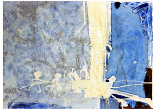
Timothy Schreiber, Black Ice Tables , 2012, Richlite paper composite, 28 3/8 X 18 1/8 inches Jenny E. Balisle, JBP.4.8.3650H , 2008, Layers of oil paint, mediums on wood panel, 30 X 42 inches