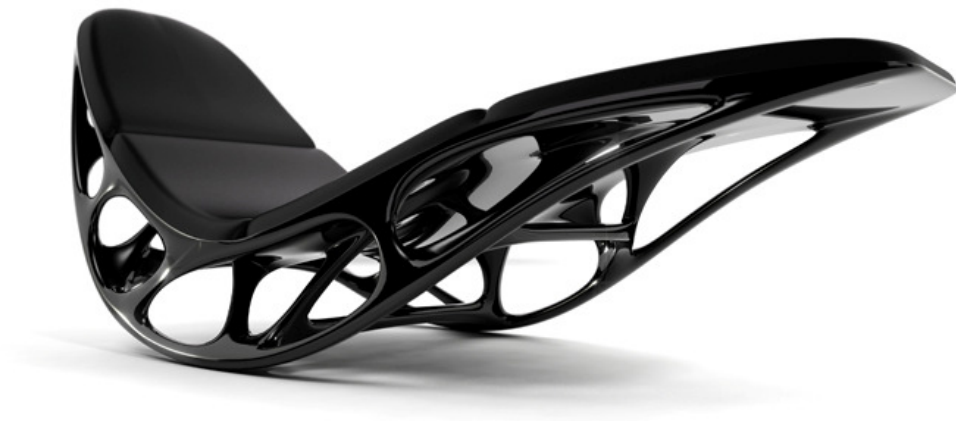
Timothy Schreiber Morphogenesis Chaise , 2010 Carbon fiber base and upholstery Edition 1 of 12 59 X 20 X 28 inches