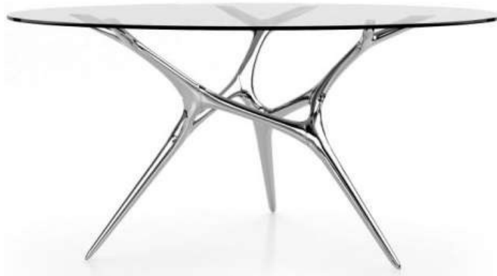
Timothy Schreiber Evolved Table , 2010 Polished aluminum, glass top 55 1/8 X 29 1/2 inches