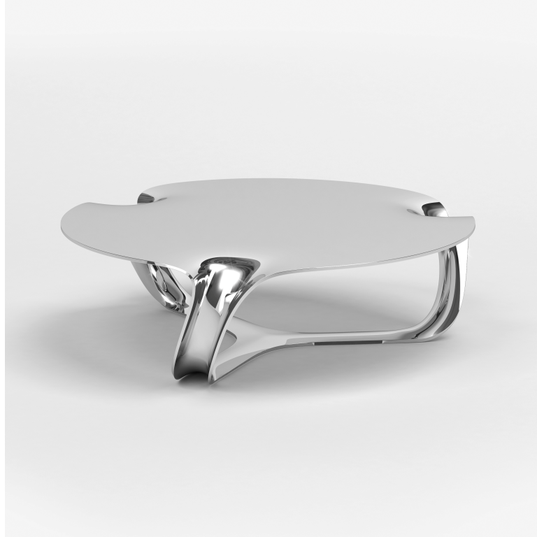
Timothy Schreiber Flow Side Table , 2010 Stainless Steel Edition 1 of 12 34 1/2 X 13 inches