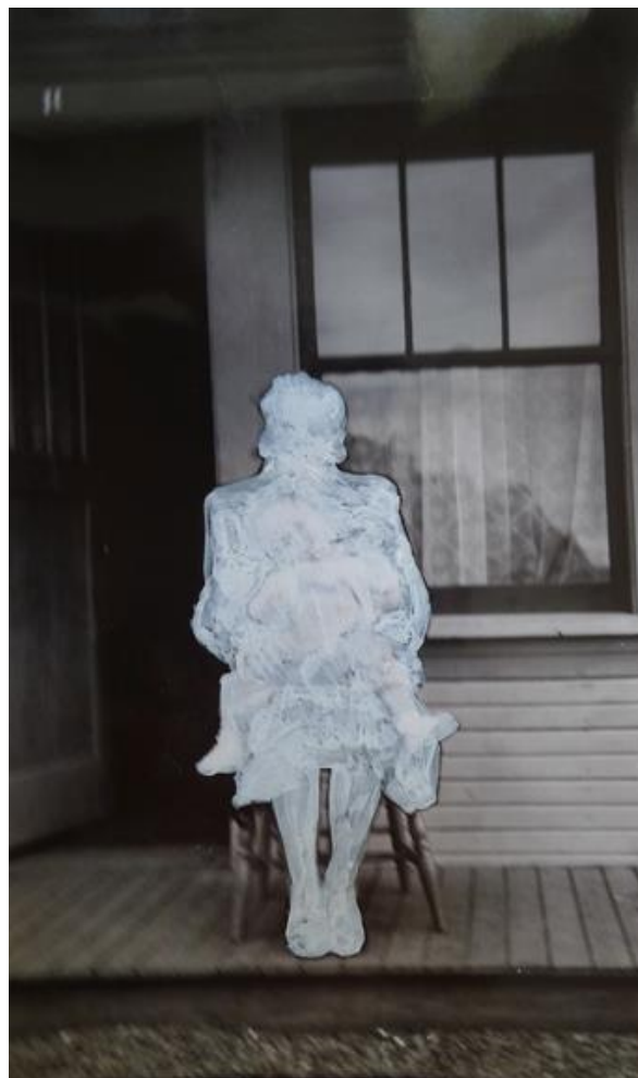
Flore Gardner Woman (White Series) Vintage photograph, gouache 3 ½ x 4 ¾ inches