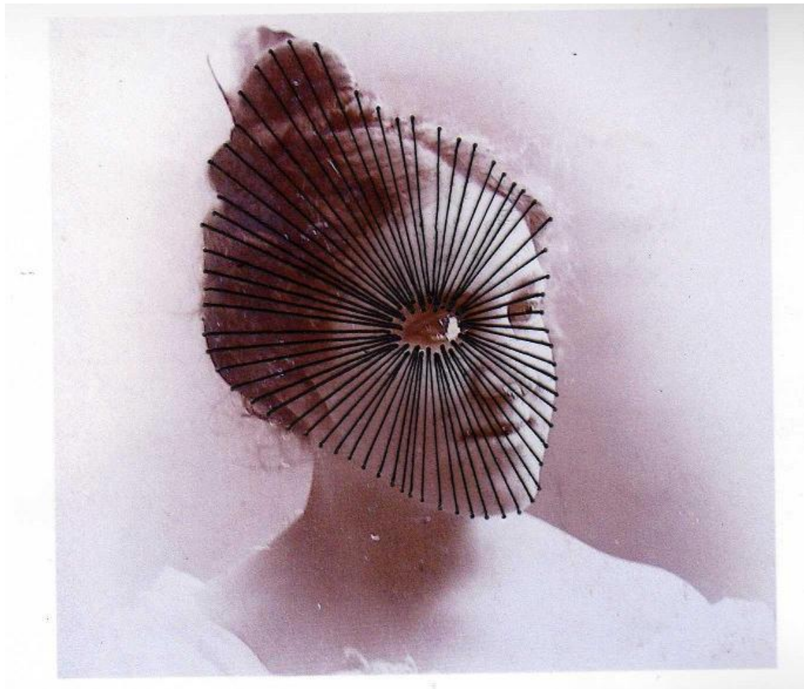
Flore Gardner Blind Eye (Embroidered Series) Embroidered photograph 4 1/2 x 4 inches