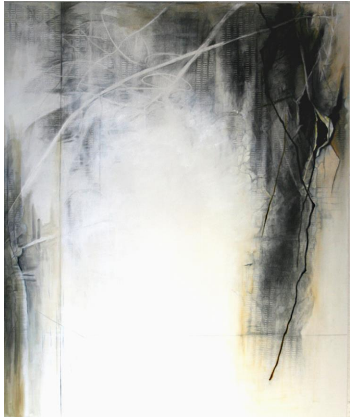
Chiyomi Longo My Space #5 , 2013 Charcoal, oil on canvas 60 X 72 inches