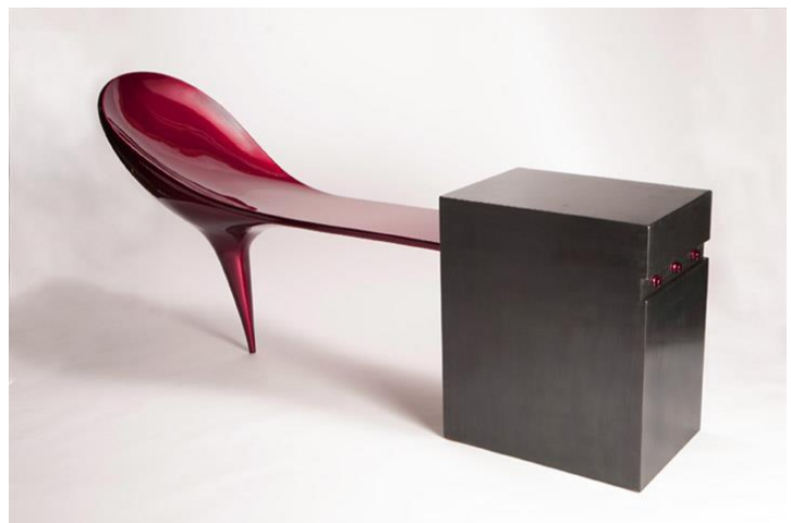
Vivian Beer Anchored Candy no. 7, 2014 Steel and automotive paint 80 X 22 X 37 inches

The Wexler Gallery is located at 201 North Third Street in the historical district of Old City Philadelphia. We invite you to visit our gallery or explore our website at www.wexlergallery.com . For high resolution images or additional information, please contact victoria@wexlergallery.com or call (215) 923-7030.