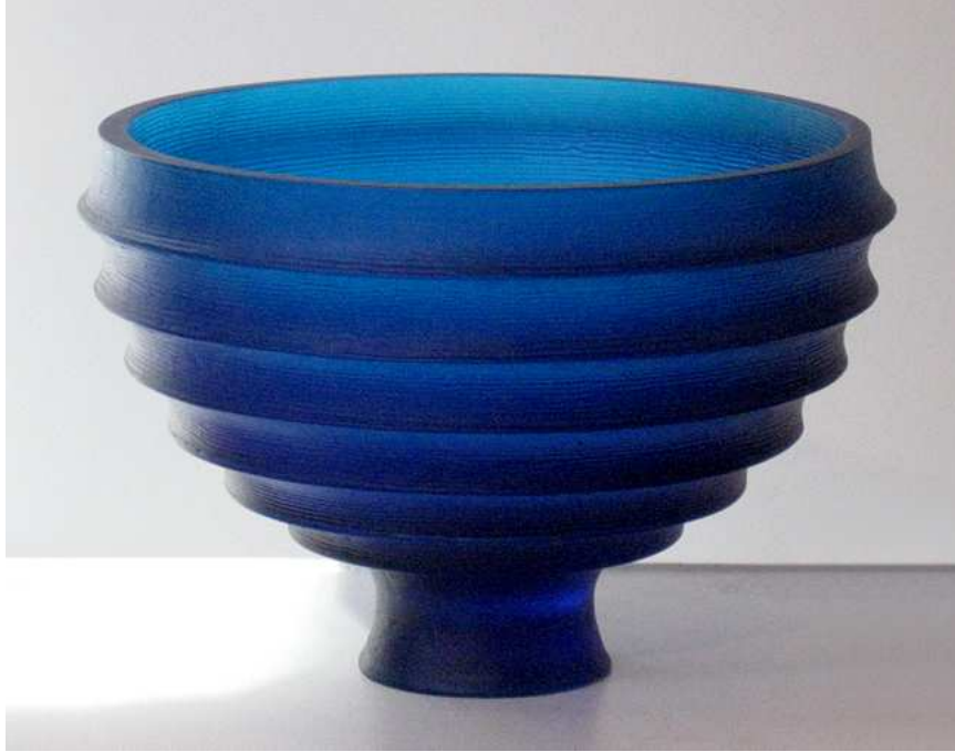
Ann Robinson Scallop Bowl, 1999 Kiln glass, lead crystal 10 X 15 1/4 inches