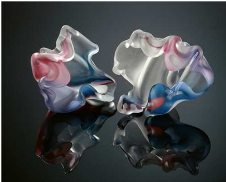
Marvin Lipofsky, RIT Group 1996-99 #2 , 1999, Blown glass, 12 1/2 x 8 x 9 1/2 inches

WEXLER GALLERY July 5 – September 28, 2013