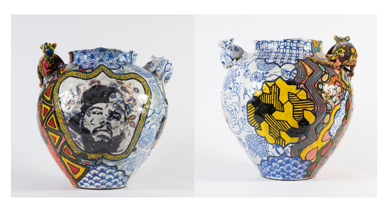
Roberto Lugo, 2021, Self Portrait Vessel With Rat Sculptures, Glazed Ceramic, 19 x 20 x 17 in