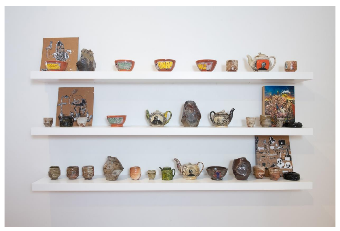
Back and Forth: Red and Meth, installed at Wexler Gallery Philadelphia.