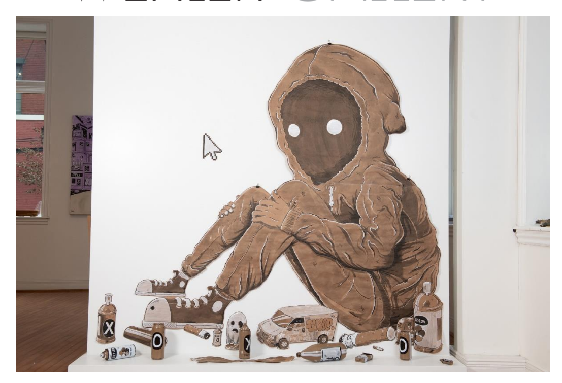
Griff Jurchak, Cramped, 2021, Ink on paper, 72 x 76 in