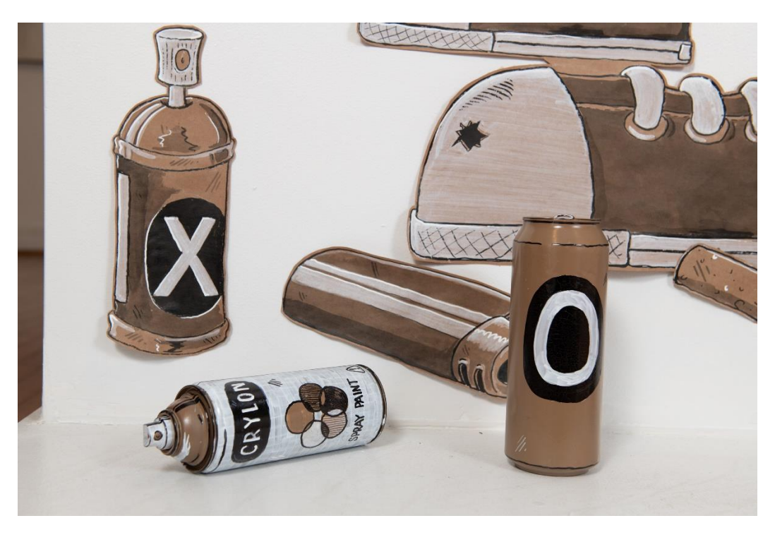
Griff Jurchak, Cramped, 2021, Ink on paper, 72 x 76 in