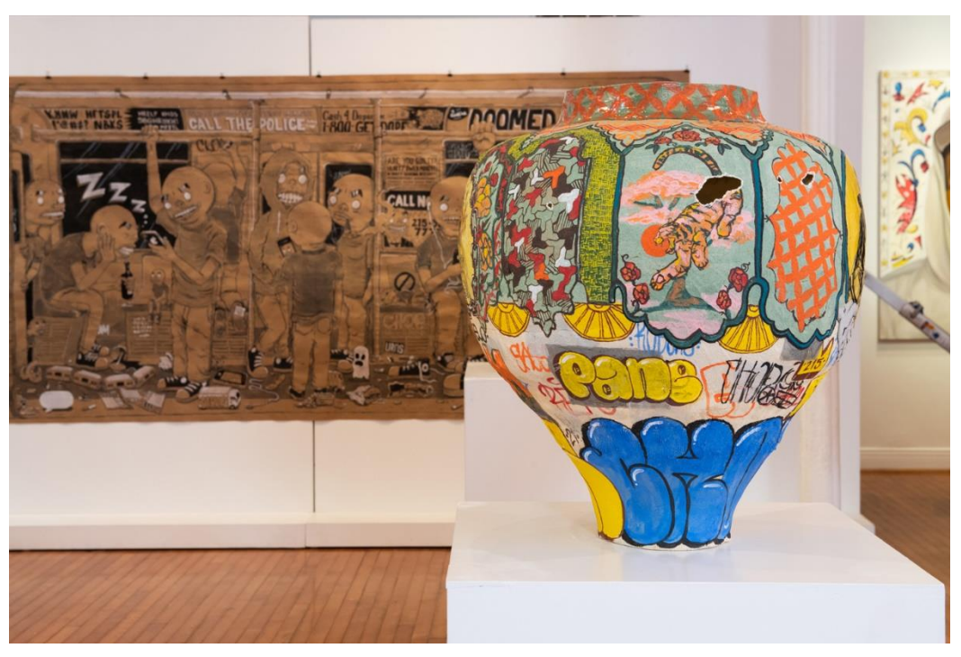
Back and Forth: Red and Meth, installed at Wexler Gallery Philadelphia.