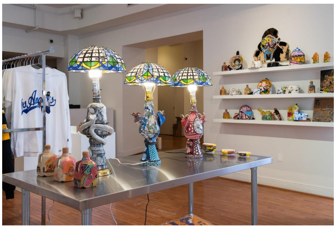
Back and Forth: Red and Meth, installed at Wexler Gallery Philadelphia.