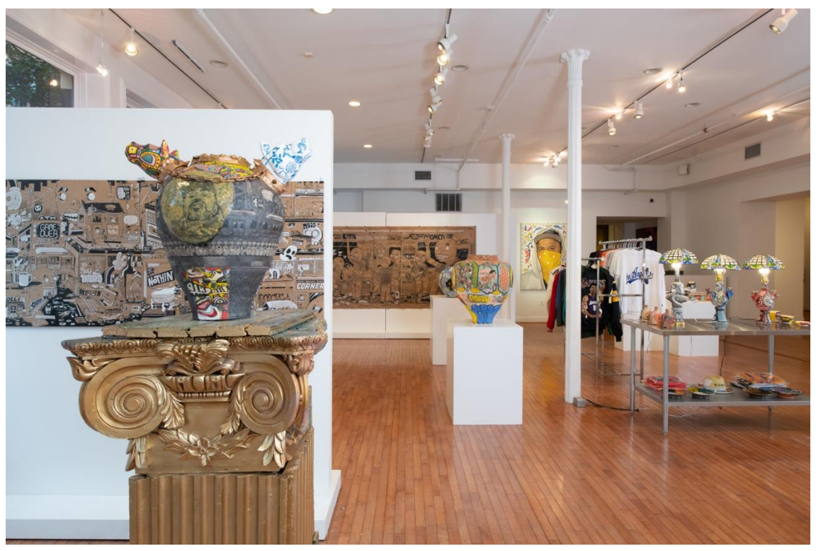
Back and Forth: Red and Meth, installed at Wexler Gallery Philadelphia.