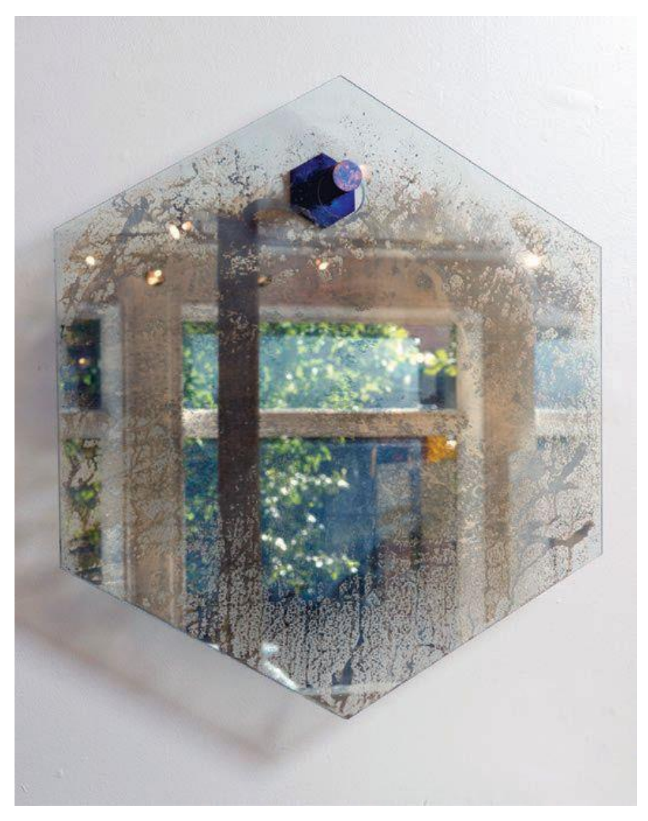
"Ernst Mirror" by Gregory Nangle