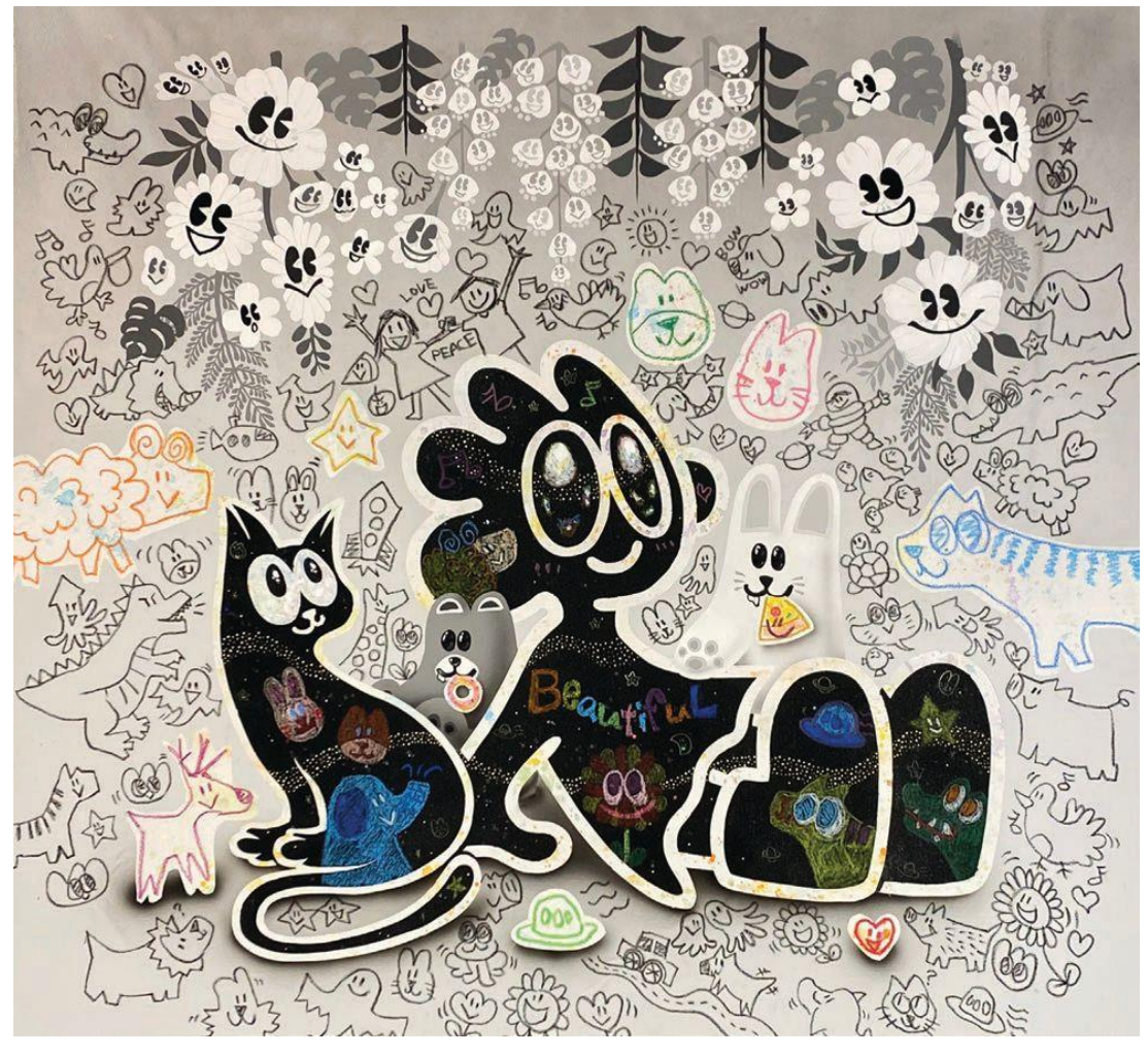
"YUM and Friends Viewing Flowers" by Yusuke Toda