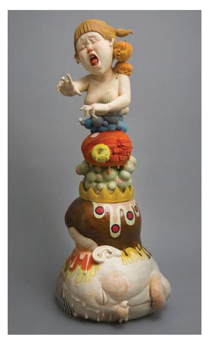
"How Have you Been? - Introspection" by Kyungmin Park.

positive, hopeful aspects of life against the black and white immutable properties of a mortal existence.